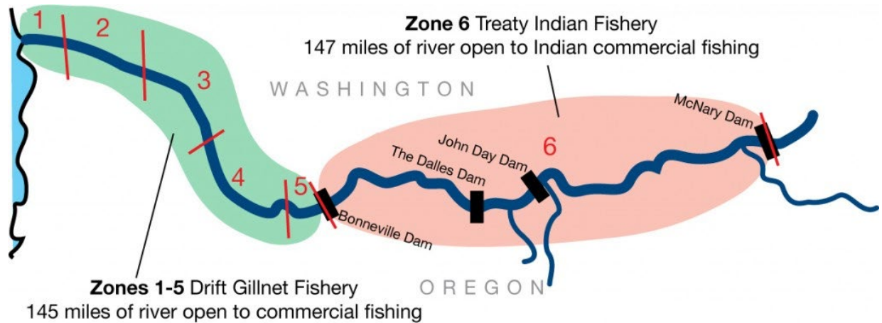
9 10 Figure 2. Map of designated fishing zones in the lower Columbia River.

1 Harvest of salmon and steelhead generally occurs within a tribe’s usual and accustomed fishing areas 2 when forecasted returns of hatchery-origin and natural-origin salmon and steelhead are sufficient to 3 provide for both a fishery and escapement for natural reproduction. Tribal harvest usually occurs in in 4 one of the fishery zones (Zone 6) of the lower Columbia River. Zone 6 extends from Bonneville to 5 McNary Dam (Figure 2). 6 Adult fish returning from the hatchery programs in the Snake River Basin are currently used for 7 ceremonial and subsistence purposes, which could have the potential to provide substantial benefits to the 8 Treaty Tribes.