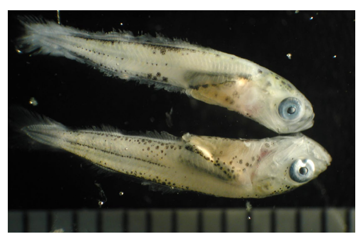
A larval pollock (top) and Pacific cod (bottom) caught during the spring ichthyoplankton survey, each ~12 mm long.

The primary objective of the EcoFOCI Spring Ichthyoplankton Survey is to conduct an assessment of eggs and larvae of commercially-important fishes, including walleye pollock and Pacific cod, over the eastern Bering Sea shelf. Observations support research on fisheries recruitment processes and contribute to our understanding of how young fish and their zooplankton prey respond to changes in climate.